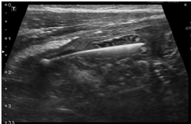
Figure 1: Sonographic imaging of right lower quadrant